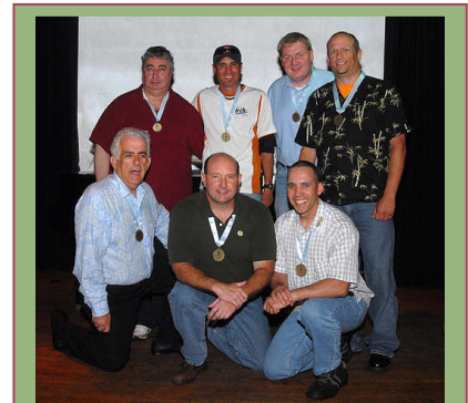
The HOF Class of 2007 will shed its "Freshmen" label this June!

Events Committee Focusing on planning and managing our events