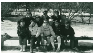
1988 Snowflake at Daisy (20 years)