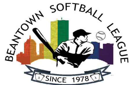
Above: The new "un-Official" BSL Logo !!! (this "hot off the presses draft" version includes 2 bean pots that will not be part of the "official" version ...)