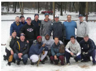
2008 Snowflake at Daisy Field.... 2 teams of 15 played on a field of new fallen snow in familiar surroundings.