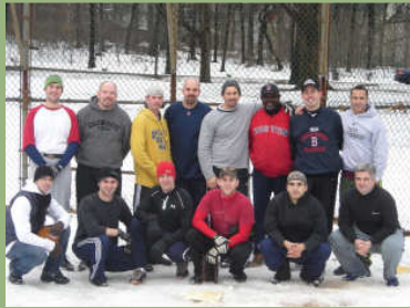
Above: Snowflake 2008 Team 2. Many felt they lost because they had no HOF members while Team 1 had 3!