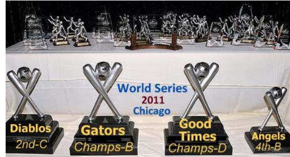
Gators & Goodtimes-Champs, Diablos & Angels finalists

We will also recognize the most recent success the BSL accomplished at this past season’s World Series where the