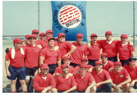
Fritz-'92 GSWS Champs in Los Angeles

Please spread the word to as many current and former BSL friends as possible, especially players from the '92 Fritz and '11 World Series teams! Beantown is “Trophy Town” and this event is a great reunion for every BSL generation and era!