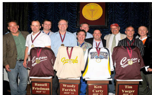
New Inductees with their HOF Sponsors